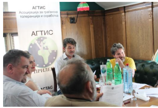
Closed expert panel with public figures and prominent opinion leaders on a national level