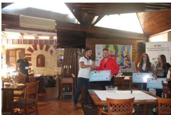
Rewarding of The Best Videos Performances