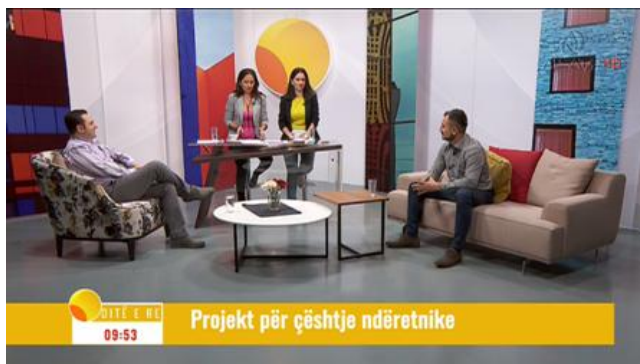
TV Show - Project Evaluation