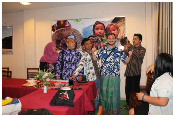
ACTAC in Nepal with the members from the Indonesian organization

Development of new and innovative methods and tools for working with youth, youth work curriculum, and training modules: Peer education, Community reporting and sustainable planning.