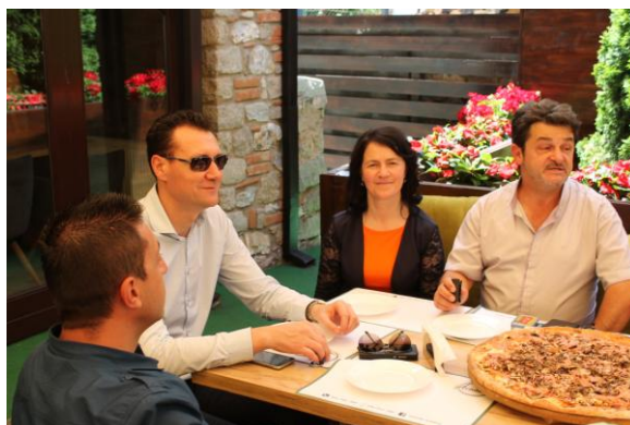
With the officials involved in the project, Director, professors and the president of ACTAC