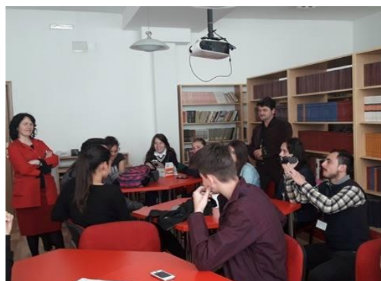
Trainings for Community reporting, Storytelling