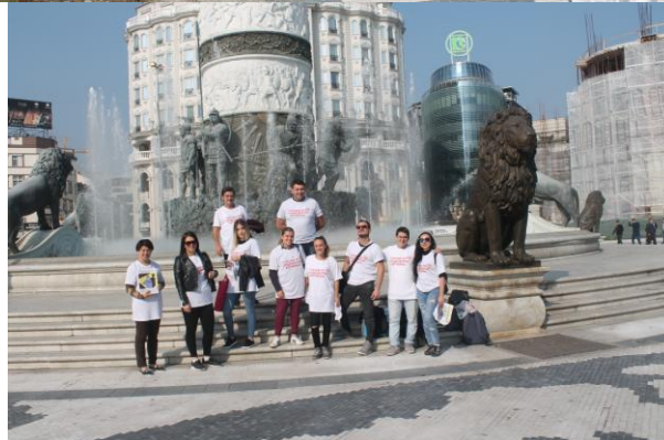
Field campaign for distribution of a brochure: "Tricks in pre-election promises" (15 cities and 30 villages in Macedonia, TV press in the capital city Skopje)