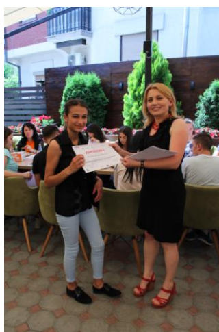
Diplomas awarding to the young girls