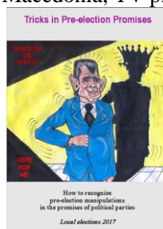
Brochure "Tricks in pre-election promises"