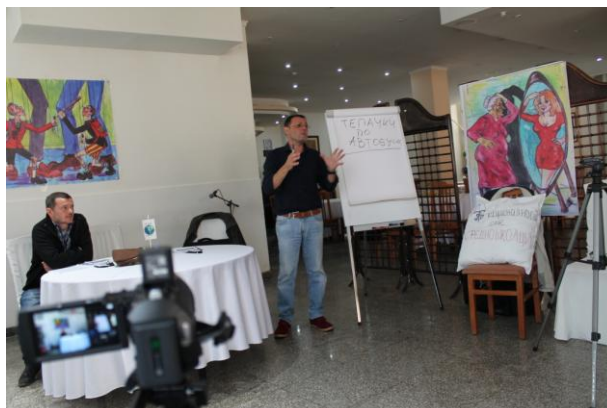
The team of "Zevzekmanija" on the workshop for video shooting and editing