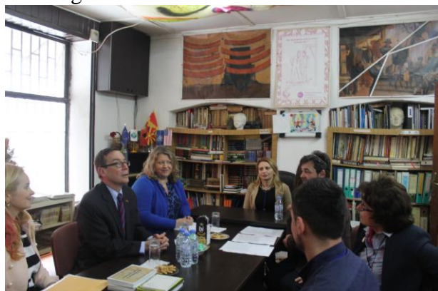
Visit of the Ambassador of The U.S. in Macedonia in the ACTAC's premises

Results: The project should contribute to understanding and expanding the views of young people for their future, in which they will start as potential, independent and motivated individuals, ready for new challenges in their future career.